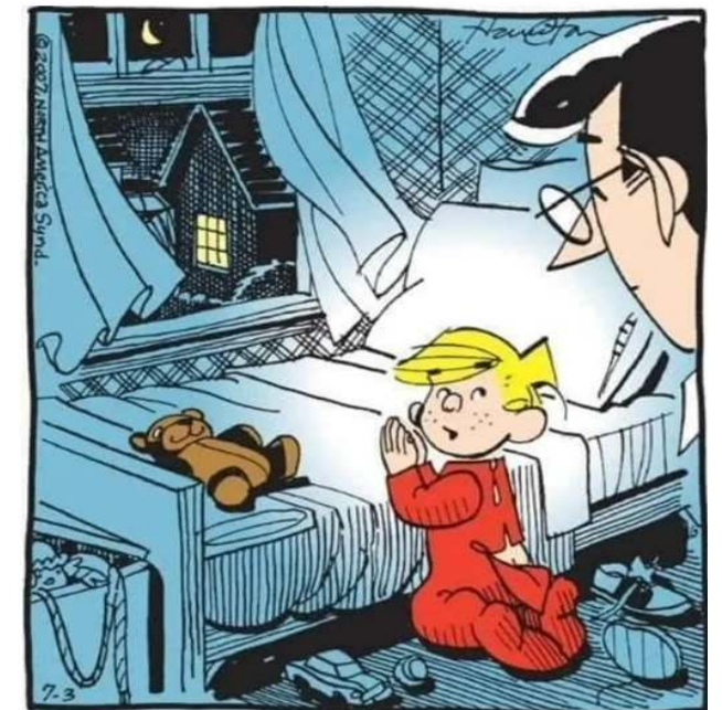
‘I KEEP THE WINDOW OPEN TILL AFTER MY PRAYERS. I GET BETTER RECEPTION WITH IT OPEN.’

Holy Family Catholic Church, 22342 Evangeline Road, Pass Christian will be holding a healing service for our nation Wednesday, July 10 th beginning at 6:30pm. Please make plans to attend, “The Healing America Service” with an evening of Pray for the healing of our Country, Service Members, Fire and Police Department Personnel, both active and retired. Exposition and Adoration of the Blessed Sacrament as well as special prayers for service personnel that played such an important role during our National Eucharistic Pilgrimage week. All are invited to attend.