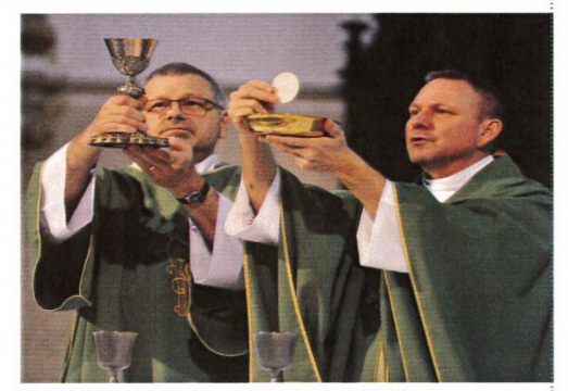
DEACON, AT LEFT

Unlike transitional deacons. permanent deacons can be