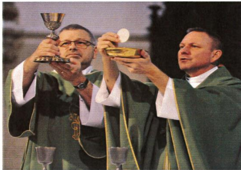
DEACON, AT LEFT

Deacons are vital to the life of the Church. Many permanent deacons have families and full-time jobs in addition to their Church work. We don't thank deacons and their families enough for the many sacrifices they make for the people of God.